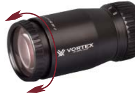
Adjust the reticle focus

Once this adjustment is complete, it will not be necessary to re-focus every time you use the rifle scope. However, because your eyesight may change over time, you should re-check this adjustment periodically.