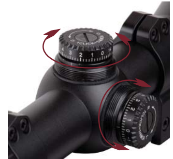
To adjust settings, turn dials: · Up / Down · Left / Right

Begin adjusting the windage and elevation settings by first removing the outer covers. Then, move the turrets in the direction you wish the bullet's point-of-impact to change. To make the adjustments, rotate the adjustment dial in the appropriate direction (up/down or left/right) as indicated by the arrows.